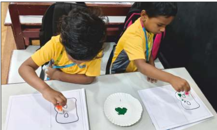
VKIDS TSK toddlers engaged in fine motor activity, sponge dabbing. This activity not only encouraged fine motor skills but also allowed students to enhance the eye hand coordination.

victorious war. 50 boy cadets (1 TN Armd Sqn), 50 Girl Cadets (1 TN Girl BN NCC), 50 Cadets - both Boys and girls (1 TN Naval Wing) of the school rendered salute to the guest and tribute to the Kargil martyrs. Capt. Chandran appreciated the School, Cadets & ANOs for making this event as a value-based learning activity.