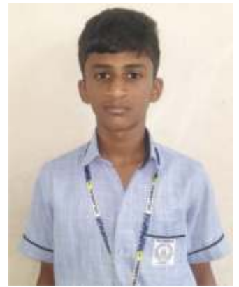
for his commendable achievement and wished him continued success in future championships.